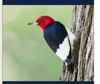
Red-headed Woodpec k er