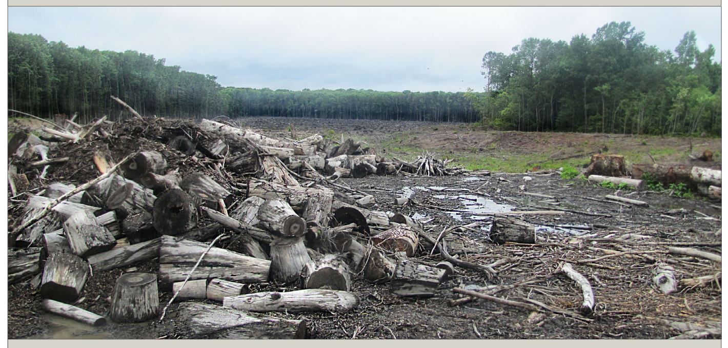
Wood pellet cut on the Roanoke River, North Carolina

Operation of the wood pellet industry in the southeastern United States contributes to irrecoverable loss of ecologically valuable forest ecosystems and further imperils many bird species that depend on those forests, while at the same time contributing to climate change.