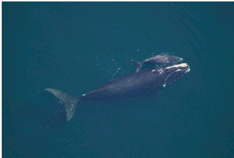
Image of a North Atlantic right whale mother and calf

66. Scientists estimate that approximately 400 North Atlantic right whales remain, with around 100 females capable of reproduction left in the population. Since April 2017, at least twenty right whale deaths have been reported, including at least nine females. In total, nearly 5 percent of the extant population is known to have died in the last two years. The world’s foremost right whale experts and NMFS’s own staff have publicly stated that the species is on the path towards extinction.